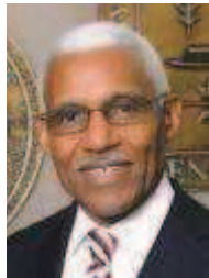
Mayor A C Wharton, Jr.