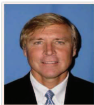
Judge James M. Lammey Office of the Courts

Shelby Co. Justice Complex - Administrative