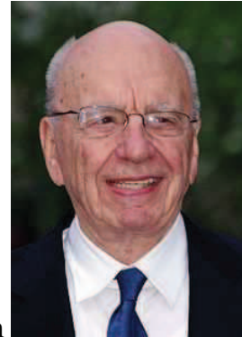
Chairman/CEO of News Corporation Keith Rupert Murdoch