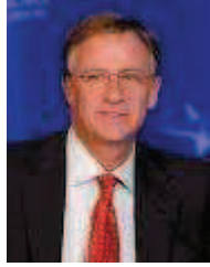
Governor Bill Haslam